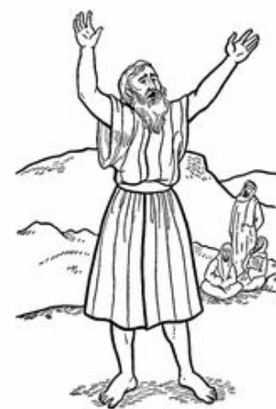
There was at this time in the wilderness of Judea a great preacher, John the Baptist. Many people came to hear him and to be baptized.